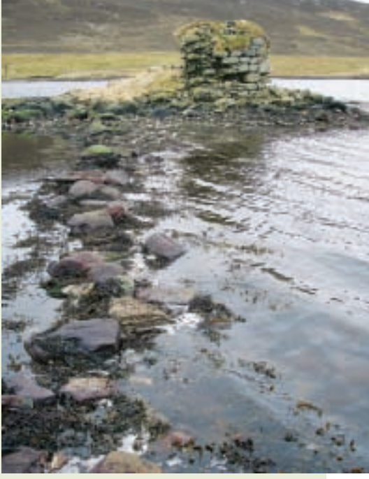
The causeway and castle at the Loch of Strom