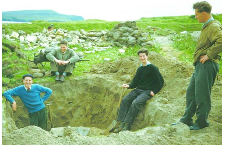
Archaeologists excavating at St. Ninian's Isle in the 1950s.

A day of lectures by historians and archaeologists will follow on Saturday, the 5th, with a visit to St. Ninian's Isle and a play by Shetland Arts on Sunday, 6th July. For a full conference programme and to book, please phone 01595 695057. Bookings must be completed by 12th June. Other events will be announced in the next issue of Unkans .