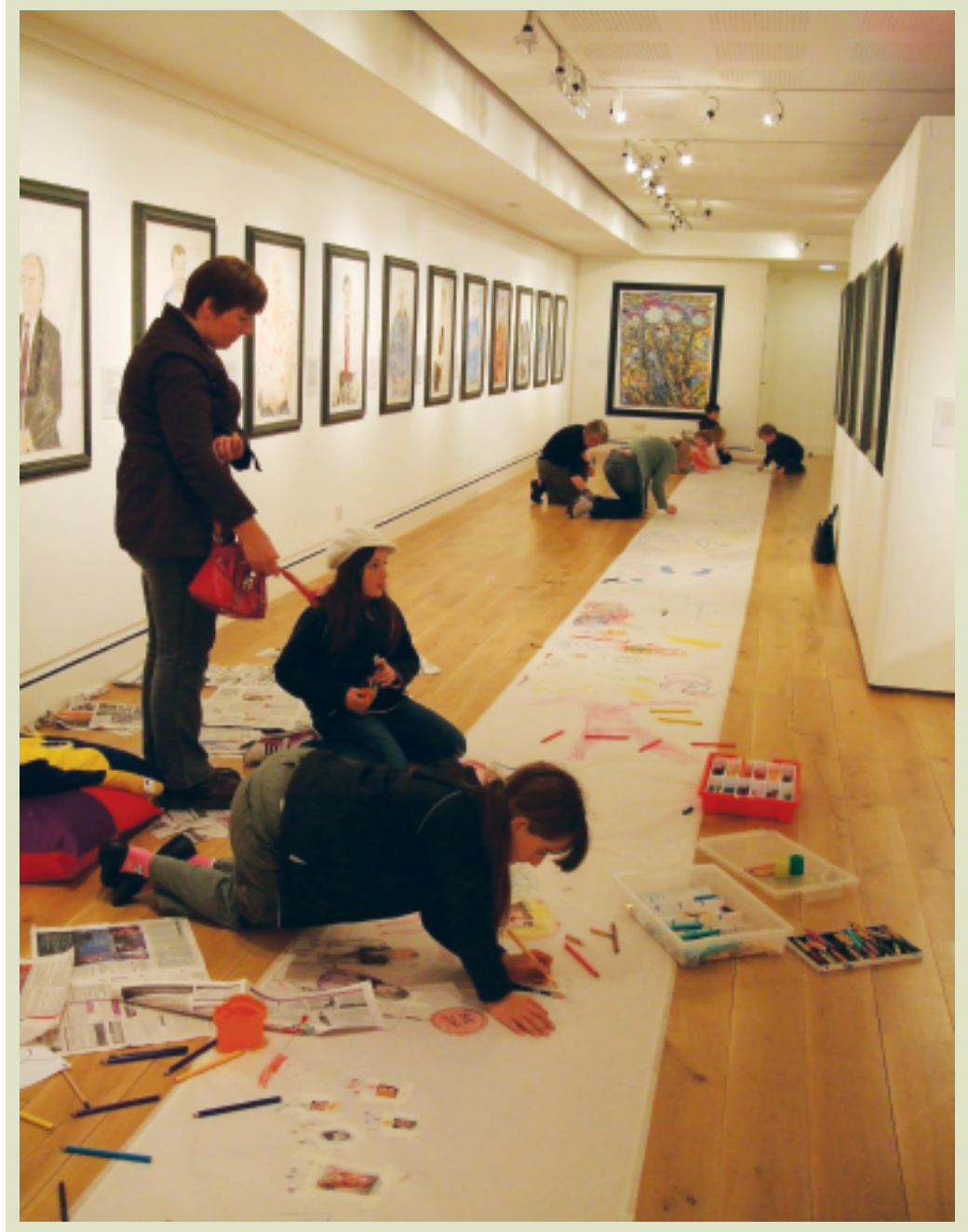
At this year's The Big Draw, artists from Veer North encouraged everyone, regardless of age, to get drawing.