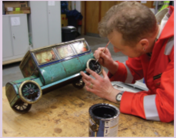
Spokes painted, and ready for the road.