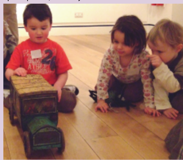
The restored bus in use.

This page is dedicated to research on all aspects of Shetland's history and heritage. Contributions are welcome.