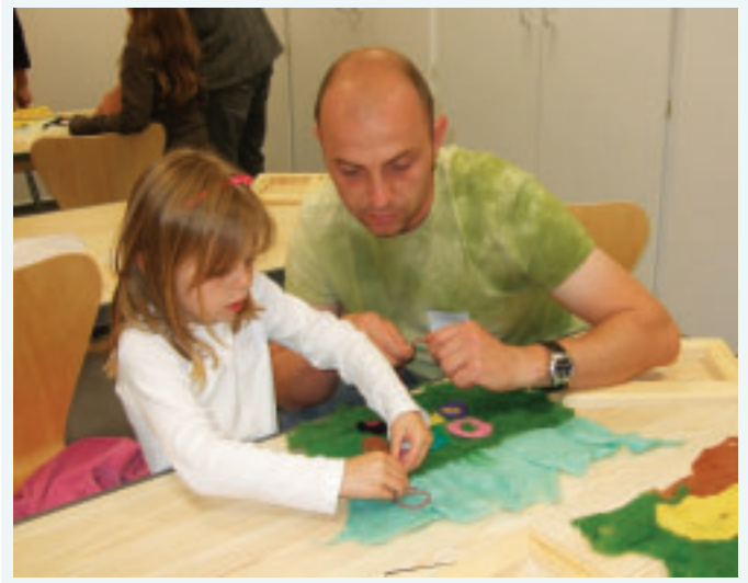
Family fun at a felting workshop.

Details of all the workshops will be in the Summer Activities booklet, distributed through schools in early June. You can also find information on our website www.shetlandmuseumandarchives.org.uk from mid June. Bookings open on Monday 21st June and prices range from free to £8 per workshop.