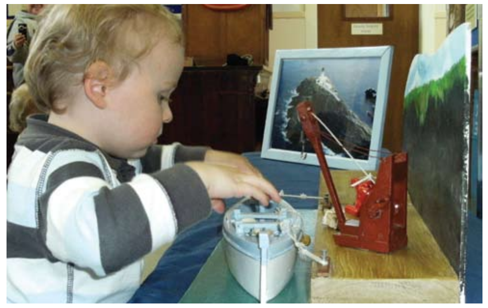
A peerie visitor enjoying the Muckle Flugga boat.

But, to return to the Heritage Centre: in addition to containing agricultural and domestic artefacts from the past and access to local census figures, it has some wonderful examples of the unique