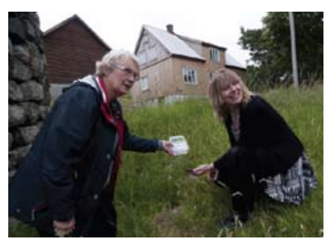
Hiding a geocache in the Faroe Islands.

For information on local events please visit www.shetland.org to view listings. To add your own event to this site please call 01595 989898 or complete the online form at www.visit.shetland.org/submit-an-event