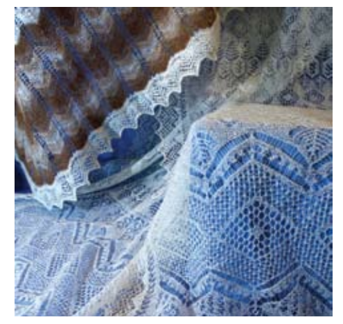
Some of the textiles displayed at the Centre.

lace making of Unst. Because of this and the Centre's link with today's expert lace makers, people come from far and wide, not only admire the craft but to study it in its homeland. Unst, of course, also boasts one of the most diverse and unique ranges of geological outcrops for its size, anywhere in the world! It is the site par excellence to see these rocks and their clear effects on the landscape and vegetation. To help the visitor appreciate this the Centre has a wonderful collection of samples and explanatory maps.