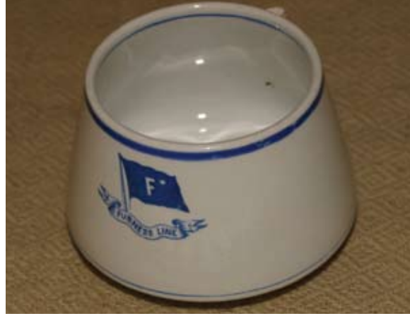
Teacup from H.M.S. Digby, dredged up from Busta Voe.

The 10th Cruiser Squadron was a group of commandeered ocean liners,