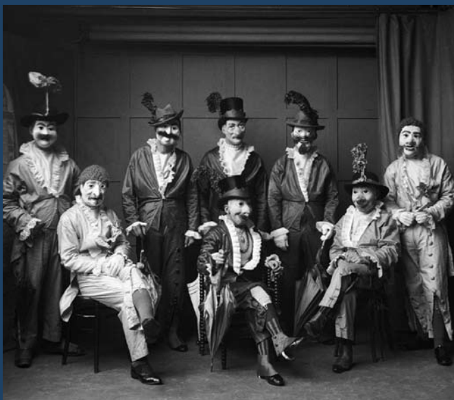
Fashions for Men' Squad.

A more standard act for the era was "Swiss Dancing Girls". National costumes were a favourite, because they offered bright outfits unique to a foreign land. In 1914 national costumes were still worn everyday all over pre-industrial Europe, and guizers could easily find imagery on cigarette cards and postcards. Britain was at the peak of her power, and patriotism inspired the squad "Britannia", this classical figure being the embodiment of Britain's imperial pride. The sarcastic "Fashions for Men" squad mocked men who wanted fashionable clothing. It was acceptable for women to follow such things, but, for reserved Shetlanders, it was effeminate. Hence their skirts contrived as trousers!