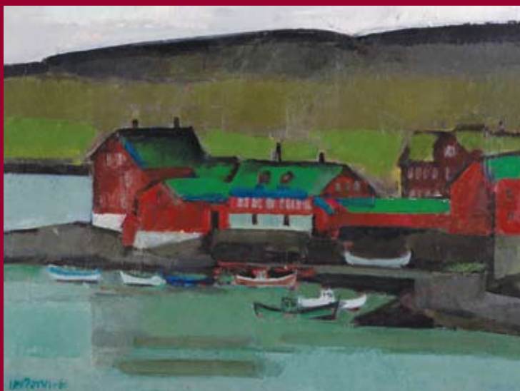
Landscape by Ingálvur av Reyni