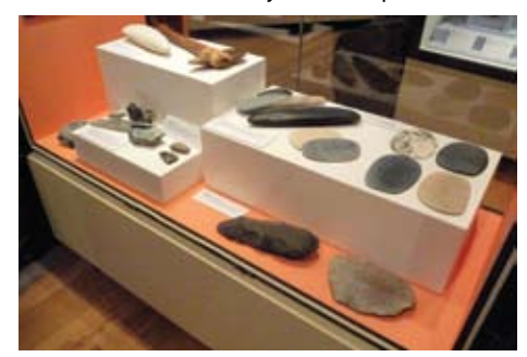
Felsite Display at Shetland Museum and Archives

Experimental work to understand the processes of working felsite will also be undertaken. Crucially, a 'felsite roadshow' is planned for June, which will give researchers the chance to record any axes in private