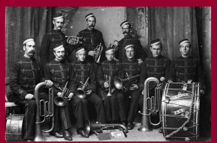
Lerwick Brass Band in its early days