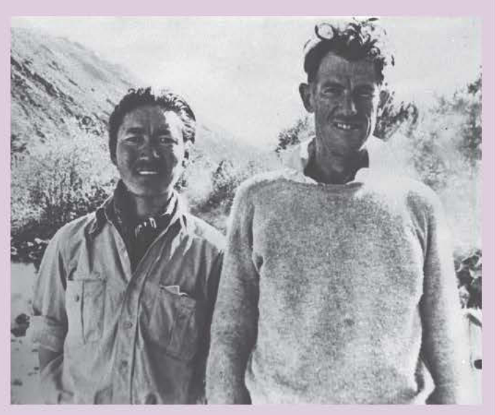
The Everest Jumper.